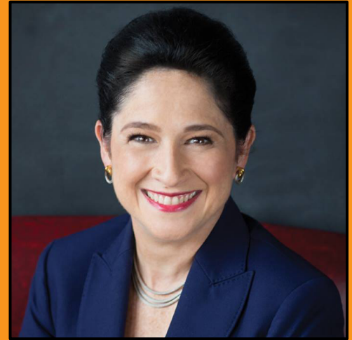
Illinois Comptroller Susana Mendoza

We have invited Comptroller Susana Mendoza to hear her assessment of the impact of women in government. As more women are elected to public office, particularly high-level positions, does their presence make a measurable difference? How can we build on their accomplishments?